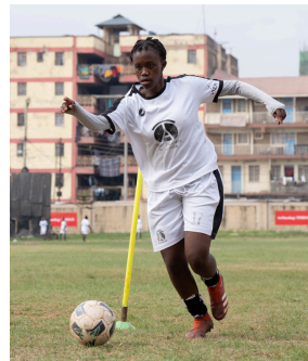
Taira Oloo Bethel University - USA