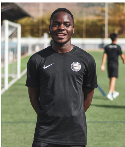
Sydney Ngala FC Malaga City - Spain